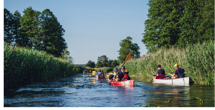
Opportunity to choose one of five boating routes along the Lielupe River from Bauska to its estuary. Along the route you will find 18 stops with pontoon footbridges and information stands on the banks of the Lielupe. www.tourism.bauska.lv

40km The cradle of Latvian Eco SPA in Southern Zemgale